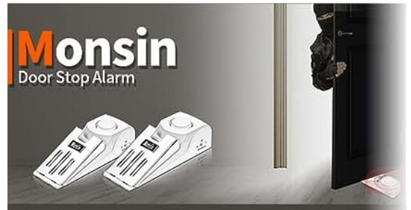
Search Monsin Wedge Alarm on Amazon

If one of these items would help ensure your safety but you cannot afford one, please reach out to Selah!