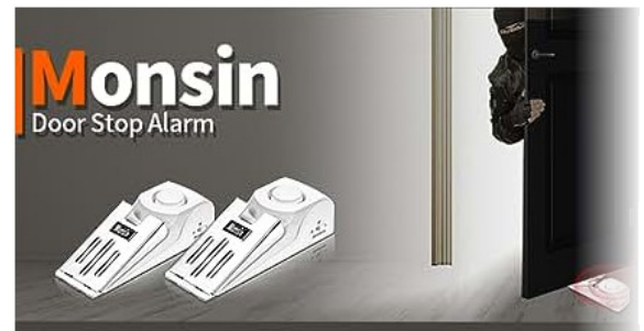
Search Monsin Wedge Alarm on Amazon

If one of these items would help ensure your safety but you cannot afford one, please reach out to Selah!