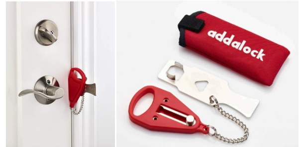
Search "Addalock" portable door lock on Amazon